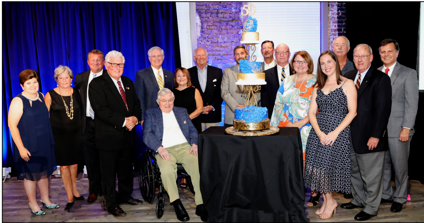
MCEDA and Port Authority Board members pictured with the MCEDA Team and 50th Anniversary Celebration Cake.

Other activities included a tribute video of EDA's history, a celebratory anniversary cake, as well as displays throughout the venue showing past and present industries, key players in economic development, important events over the past 50 years, and the development and success of local industrial parks such as Mallard-Fox Creek and Morgan Center Business Park.