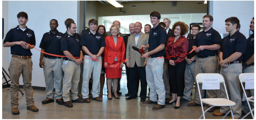
AMT students and partners at the Ribbon Cutting on October 2, 2014.

A partnership between Calhoun Community College, Toyota Motor Manufacturing Alabama, Sonoco and other local industry, led to a collaborative known as the Alabama Federation for Advanced Manufacturing Education (Alabama F.A.M.E.). The Advanced Manufacturing Technician Program (AMT) launched in October at the Alabama Robotics Technology Park.