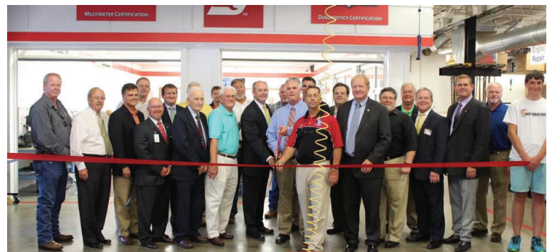
Morgan County Career Tech Facility Open House & Ribbon Cutting on October 1, 2014.

The Morgan County Schools Foundation and Brewer High School hosted an Open House on October 1, 2014, to showcase the new Morgan County Schools' Career Tech Facility.